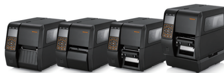
Standard Auto cutter Peeler Rewinder + Peeler